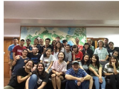
[SYME Alumni night]