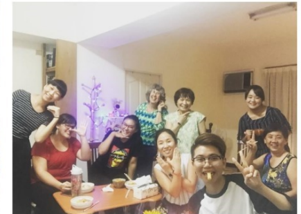
[Girl's Bible Study Group]