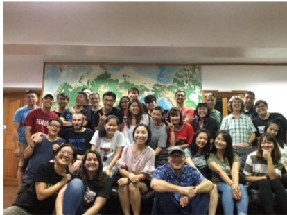
[SYME Alumni night]